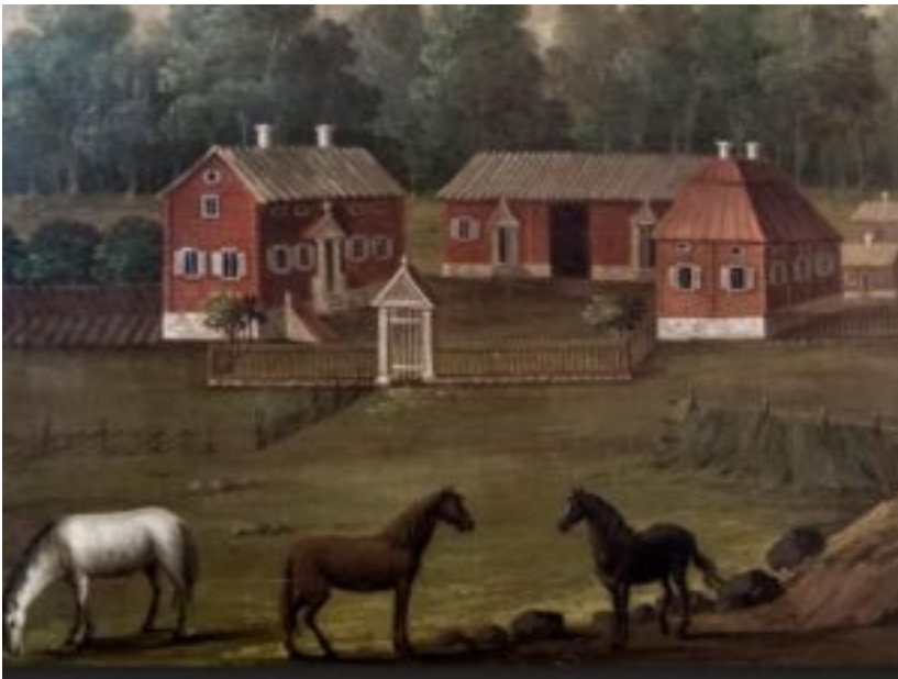
Estate of Sveden

Emanuel Swedenborg was a member of one of the noble families of the Stora Kopparberget area in Falun, Sweden (a UNESCO World Heritage ). His father was born at the estate Sveden a couple of kilometers east of Falun. The name “ Sveden ” indicates that it once was an area of burn-beating agriculture and it just by coincidence is the same as the country name “ Sweden ”.