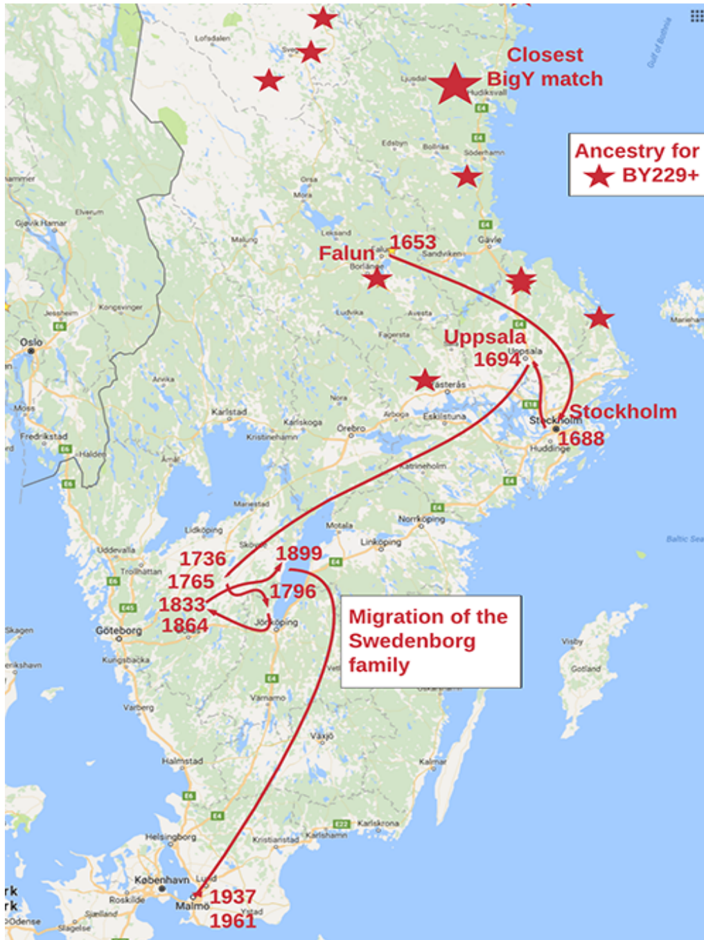
Swedenborg – origin and migration