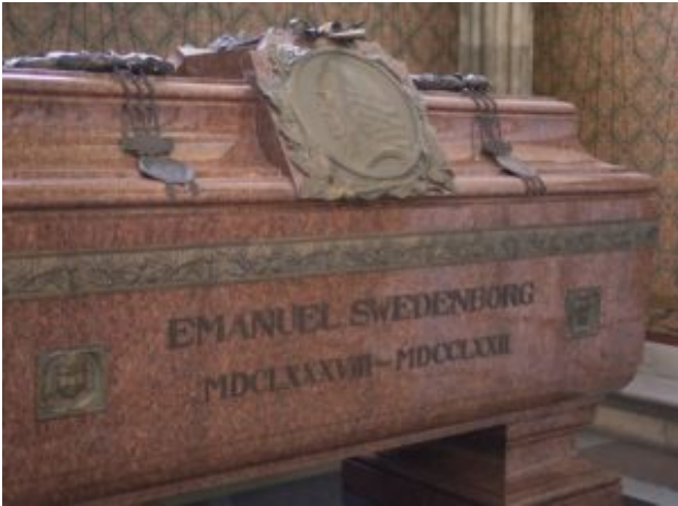
Sarcophagus of Emanuel Swedenborg, Uppsala Cathedral

Emanuel Swedenborg died in London but is since 1910 resting in a sarcophagus in the Uppsala Cathedral. His cranium was bought for £ 1,500 at Sotheby's in 1978 to be reunited with the corpus.